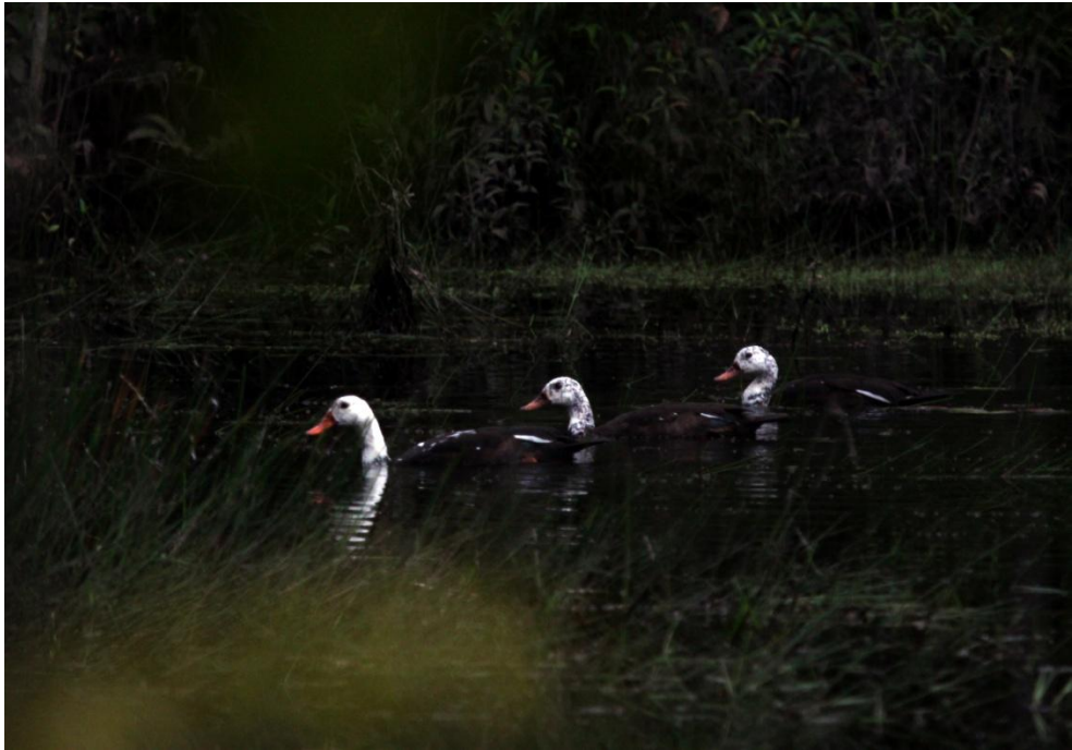
The first WWD group (3 young WWD)