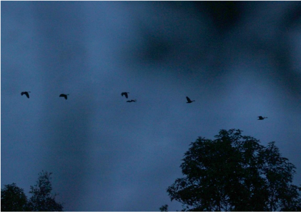
The "KIKUK swamp" : there has never been any WWD observer/researcher explore this area until now