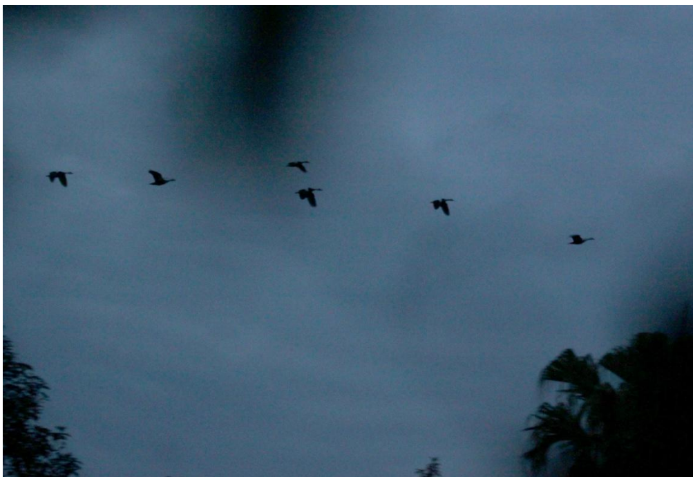
The second WWD group ( 6 birds )