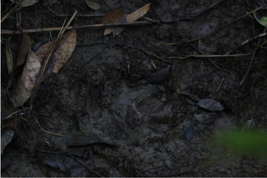
Sumatran Tiger Footprint , 30 meters from observer camp