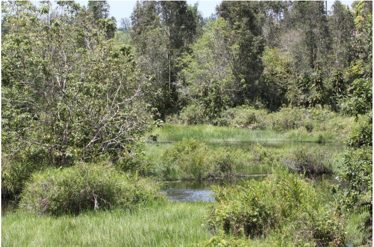
One of 'Kikuk Swamp' Spot