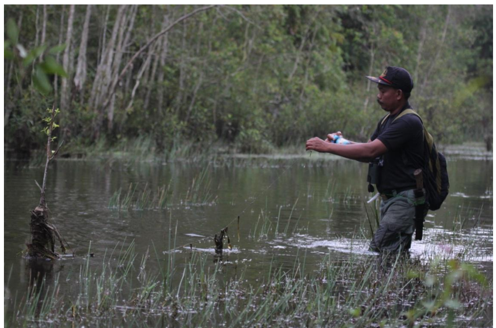
We still find some ex-illegal fishing track (abandon camp and fishing sticks)