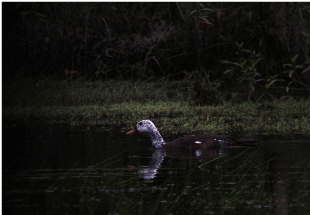
Young WWD (still has scattered black spot on it's white neck/head)